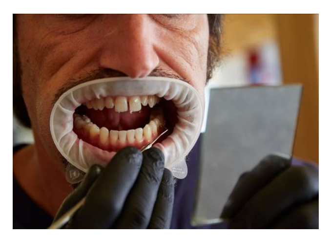
Figure 12. Testperson controls the inserted crown by himself using a mirror.