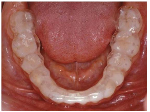
Figure 5b. Stabilization splint with anterior guidance inserted on the lower teeth of a patient who is pressing and clenching with his steeth and suffers from pain of the temporomandibular joint.

International Conference on Environmental Systems