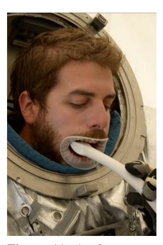
Figure 11. Analog astronaut uses the intraoral scanner and scans the affected area himself during the simulation.

During the simulation it became evident, that the inclusion of a positioning guide would greatly improve the process. As a result point (5) and (6) were adapted accordingly.