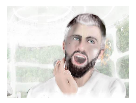
Figure 6. Caused by an accident astronaut Sirius M. has lost one of his dental restorations. He is instantly suffering from severe pain and cannot carry out his duty anymore. ( image credit: space-craft Architektur, D. Krljes )

The assumed scenario for the replacement of a dental restoration is based on the fictional accident of an astronaut during a Mars Mission. As he tumbles during a routine work, he injures his jaw. The impact also causes the loss of a crown and he needs immediate medical help (Fig. 6).