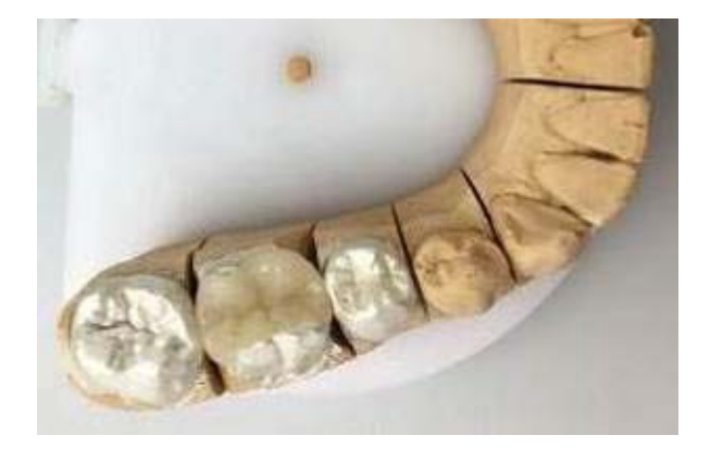
Figure 5a. Partial crown made from ceramics on a model.