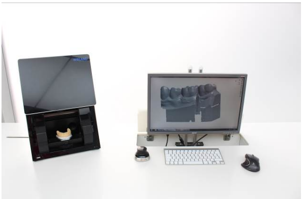
Figure 2a. Technical workspace and machine room of a state-of-the-art dental laboratory.