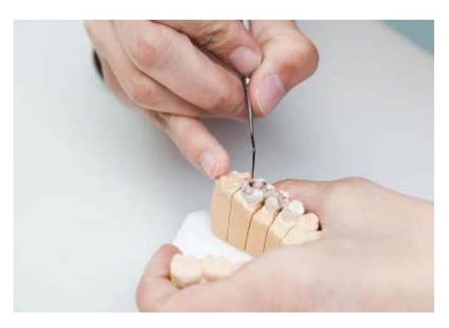
Figure 3. Dental technician 'finishing' a crown made of ceramics

But what would happen, if an astronaut on a long-term outer space mission suffers from dental and/ or jaw problems that cannot be treated sufficiently by pain medication?