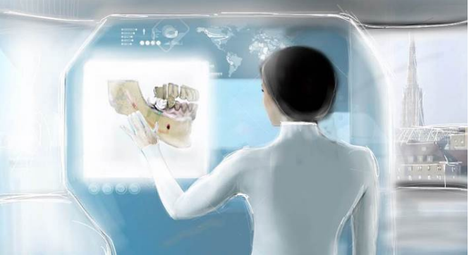
Figure 7. Sirius M or a crewmate is scanning his upper and lower teeth with an intraoral scanner. The 3D data set is transferred to Earth